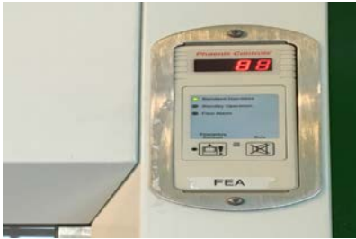
Lash Miller Wing